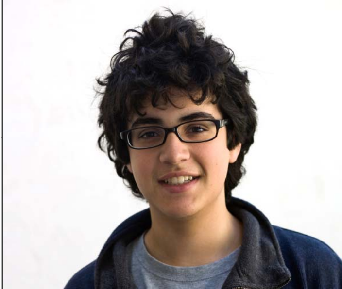
Age 16 NGC Team Member Since 2007

“I want to help make the world a better place by focusing on the major challenges trapping people in a life of poverty and hunger.”