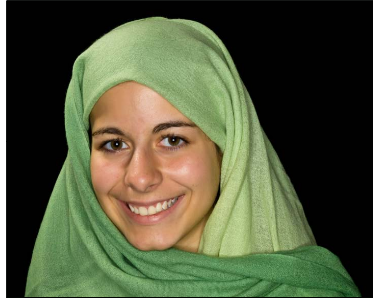
Age 15 AIL Student Since 2007

“I want to help make the world a better place by focusing on the major challenges trapping people in a life of poverty and hunger.”